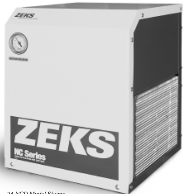
24 NCD Model Shown