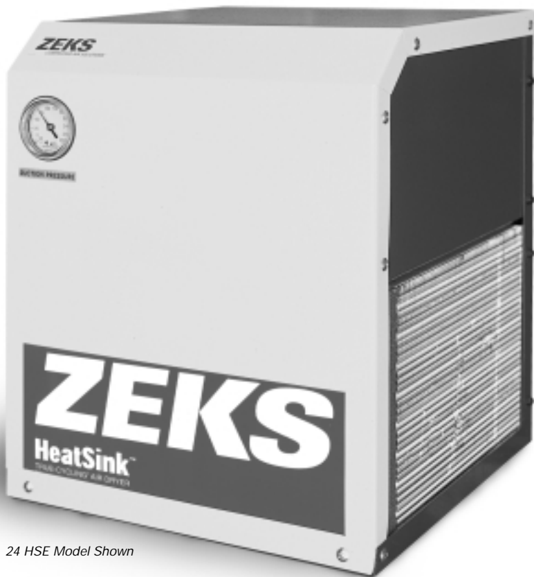
24 HSE Model Shown